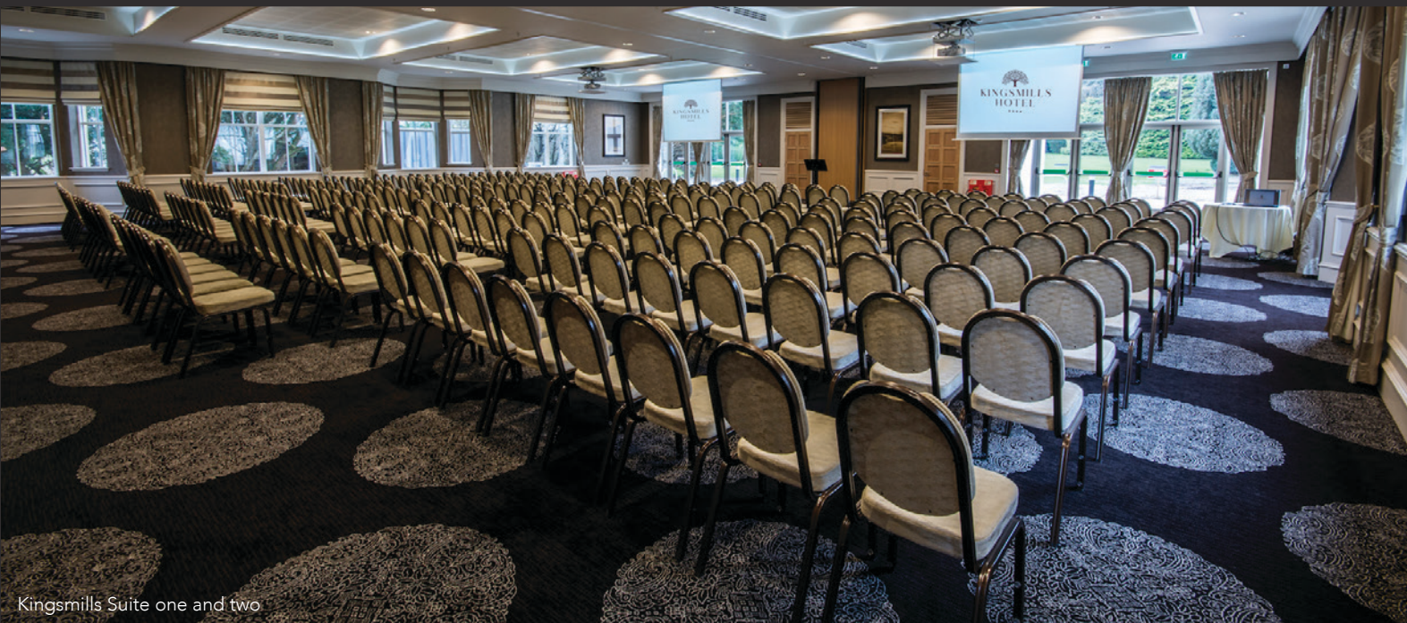
Kingsmills Suite one and two