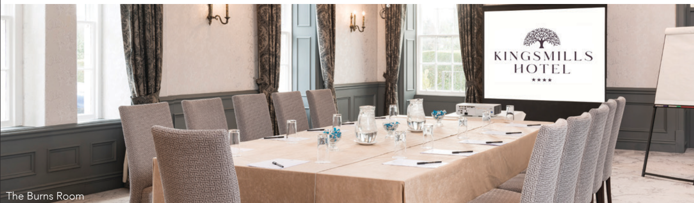
The Burns Room

Contact us on 01463 257102 or email events@kingsmillshotel.com