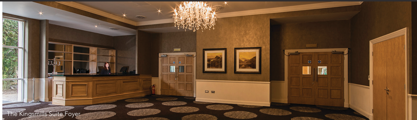
The Kingsmills Suite Foyer

From your initial enquiry until your last guest departs we will support you and care for your guests.